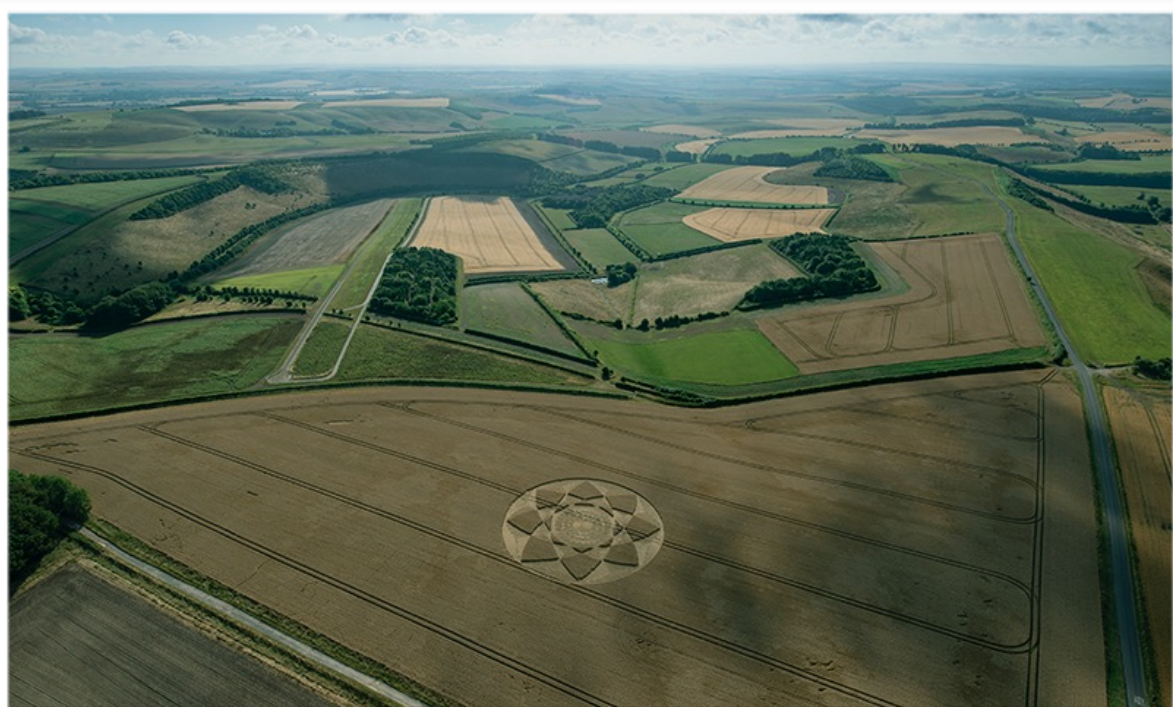
One of the magnificent crop circles of the 2018 season