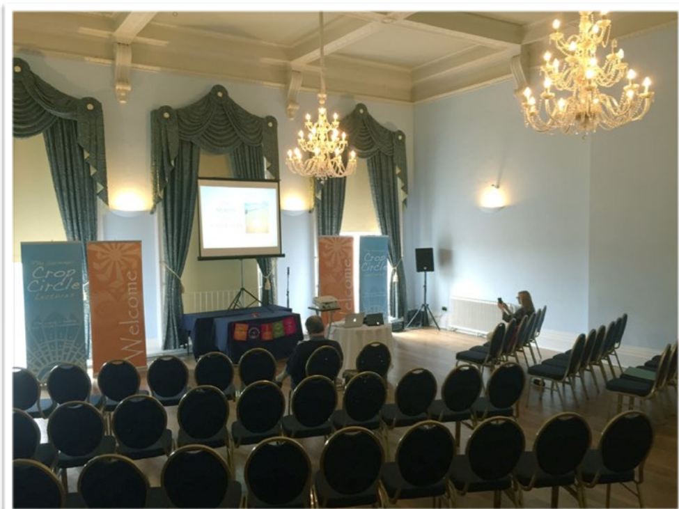
The beautiful Ballroom in the Bear Hotel - all set-up and ready to go...