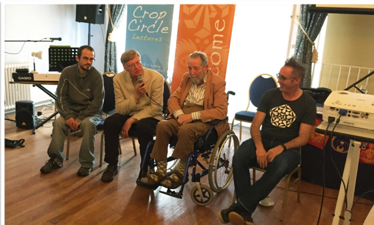
A little group discussion between some of our 2017 speakers...