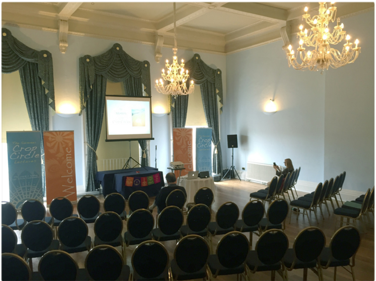
The beautiful Ballroom in the Bear Hotel - all set-up and ready to go...